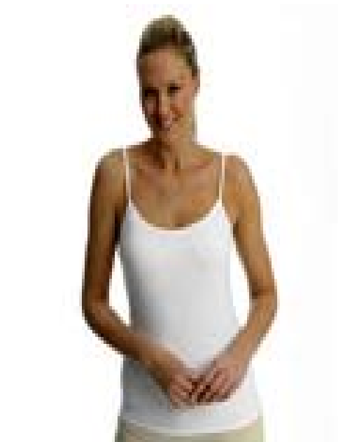
LADIES BASIC CHEMISE