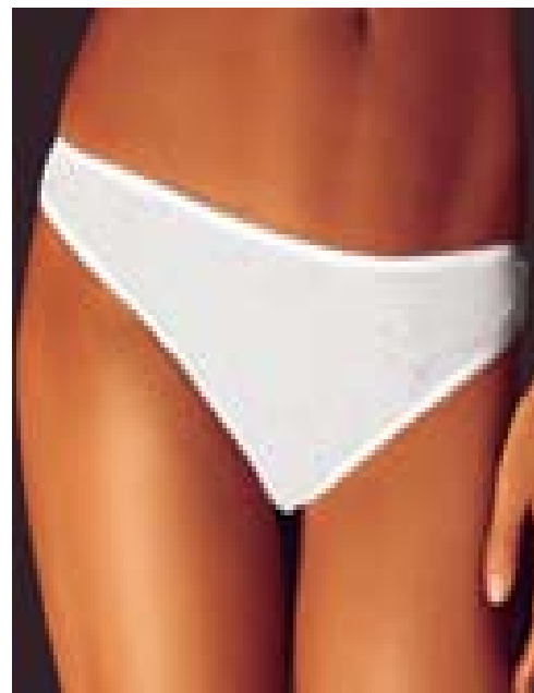
LADIES BIKINI (BASIC)