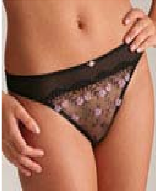
LADIES BIKINI WITH LACE