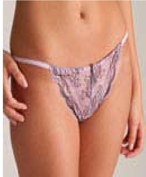
LADIES STRING BIKINI